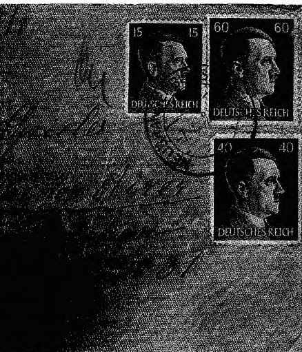
Figure 9 ed in UK, there would be no further the cover suggests that it was not possibly due to considerable censorship "Imed List" shows several blacklisted mo 2031 apartment block address. s I will show the resealing procedure hurst PC-90 labels

to the end of July 1942, airmail was a "LATI substitute" service between the urgent need for mail interception post, of this mail went unexamined. its that called at Bathurst are hard to began uncovering this Pan American been aware of its existence or its sig- ons and cover examples will enable preciate what can be found.