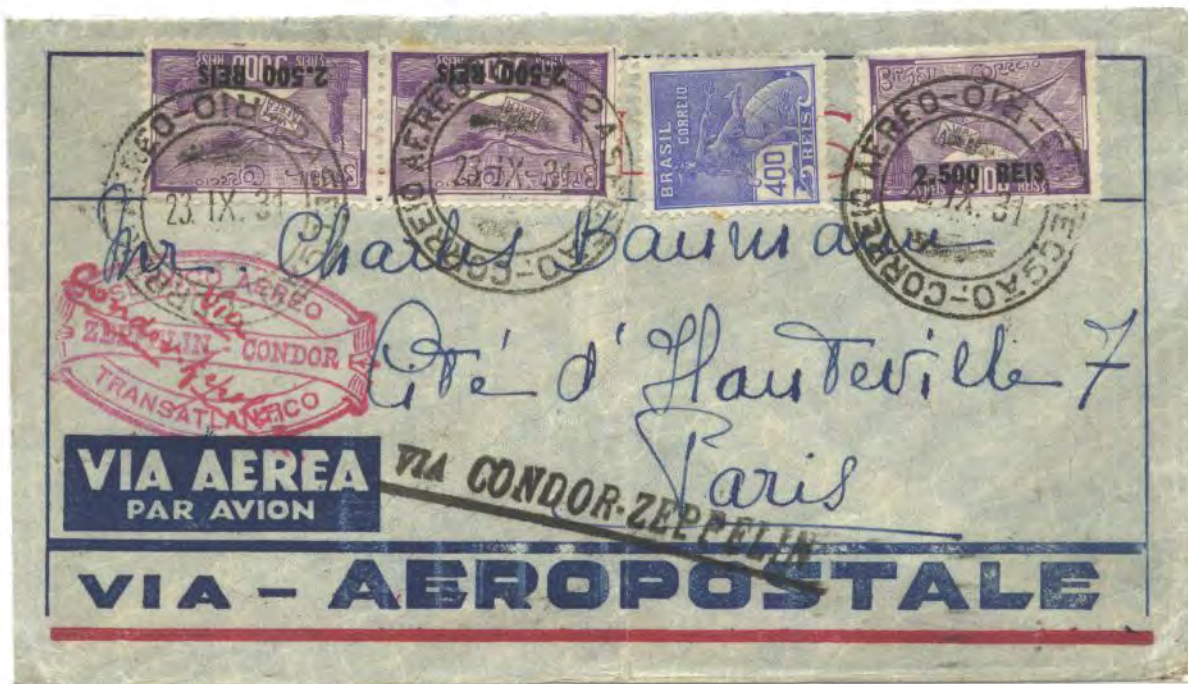
Personal Mail Routed via Condor-Zeppelin Airmail Service - Condor airline connection from Rio to Recife - Postage 7$500 airmail (3 x 2$500 per five grams), 400 surface.