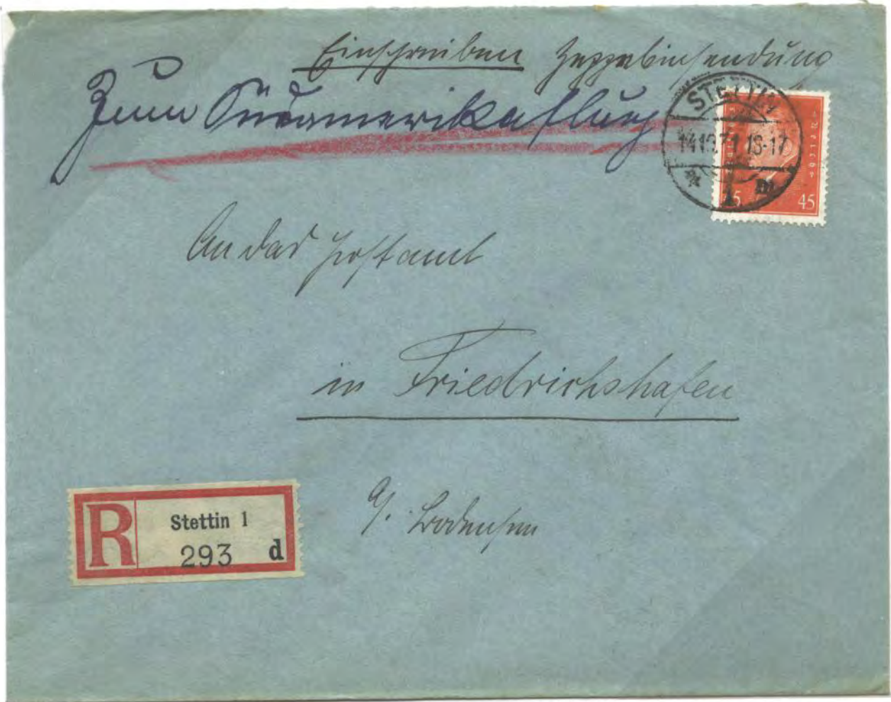
Carrier Cover Endorsed "Zum Südamerikaflug" (For the South America Flight) - In 1931 German zeppelin airmail had to be forwarded under cover to Friedrichshafen or Berlin to be flown to South America - Domestic postage .15 letter, .30 registration.