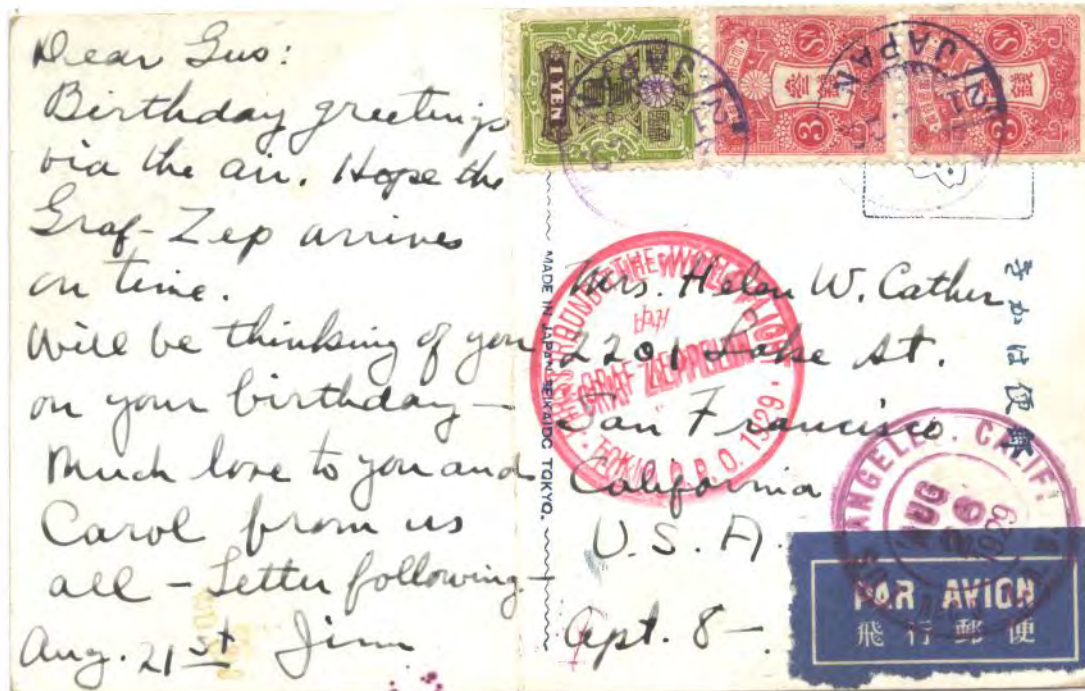
Birthday Greetings from Japan - Flown across the Pacific to Los Angeles - Postage 1.00 yen airmail, .06 yen surface card.