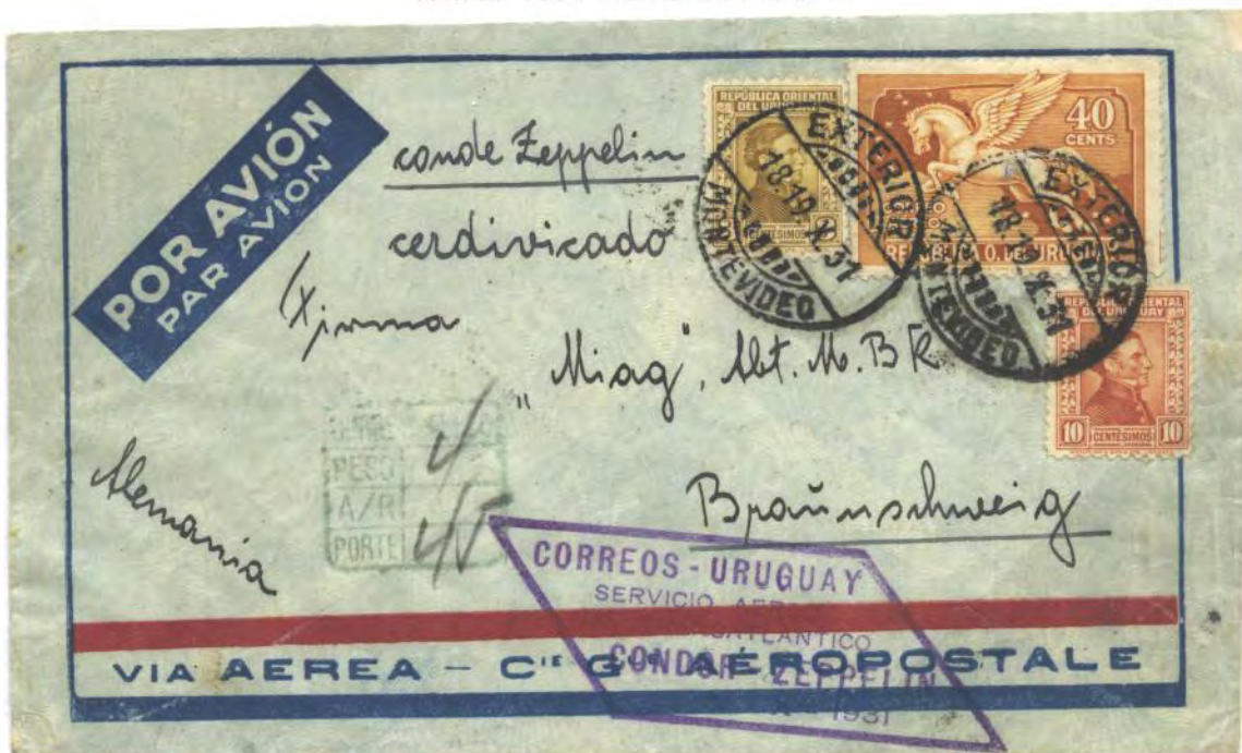
Uruguay - Business Letter to a Company in Germany - Boxed marking shows weight and airmail fee - Weight 4 grams - Postage .45 airmail, .08 surface.