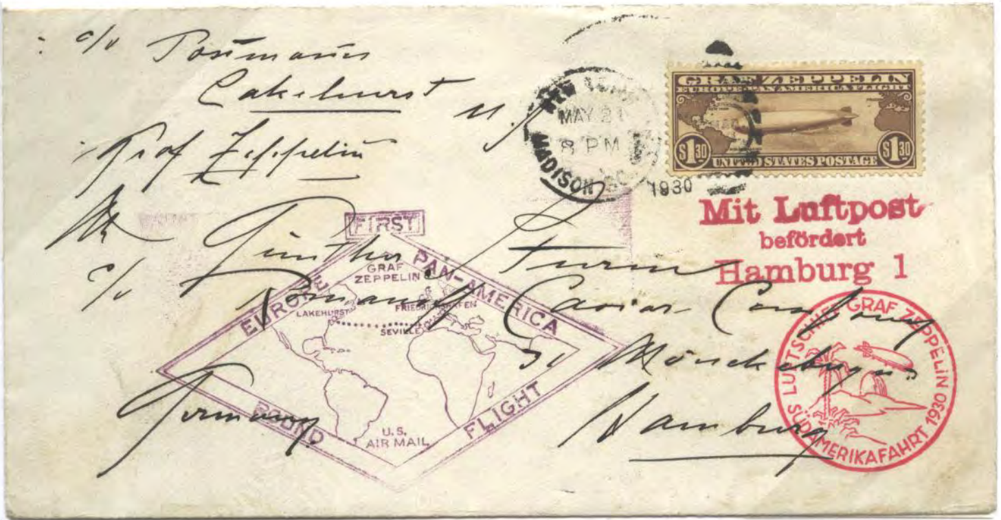
Personal Letter from Same Correspondence - Addressed in same handwriting to an associate of the Romanoff Caviar Company in Hamburg - Red "Mit Luftpost" marking for delivery by airplane to Hamburg after zeppelin arrival.

Non-philatelic use of $1.30 Graf Zeppelin stamp to pay zeppelin letter rate to Europe.