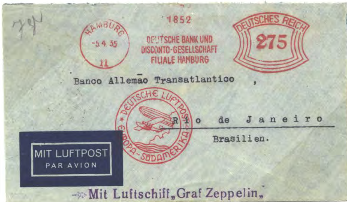
Representative Business Mail Flown by Graf Zeppelin to South America

Special Features - An extensive selection of commercial foreign dispatches, a range of special services used in connection with zeppelin flights - express mail, pneumatic mail, Hamburg streetcar mail - incorrect and experimental cachets - disruptions in the commercial routes because of revolution and civil war.