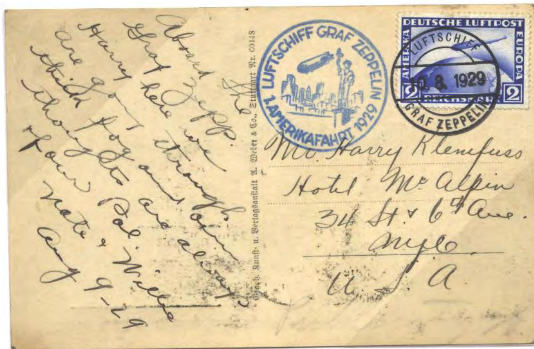
Passenger Mail Describing Flight - Posted on Board - Postage RM 2.00 transatlantic post card.

For the return flight, only mail posted on board received the blue German cachet for the America Flight - Other mail received the purple American cachet for the Flight around the World.