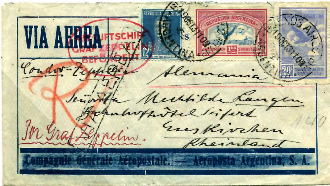
Argentina - Registered to Germany - Generic zeppelin cachet added on arrival in Germany on Argentine registered mail only - Postage 1.08 pesos airmail = 6 x .18 per gram, .20 registration, .12 surface.