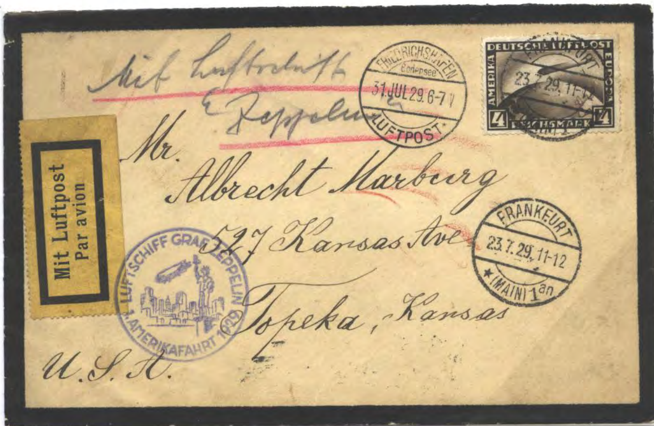
Mourning Letter Accepted at Frankfurt against Regulations - Should have been sent under cover to Friedrichshafen instead - Postage RM 4.00 transatlantic letter.