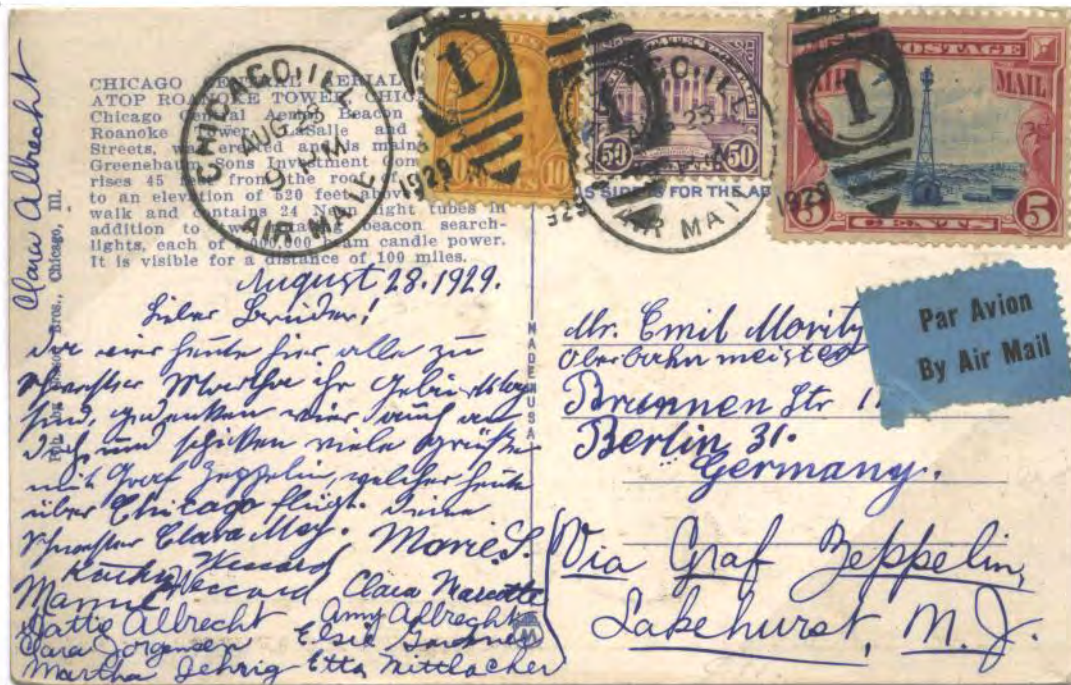
Family Greetings Flown across the Atlantic Ocean - Postage 60¢ zeppelin airmail, 5¢ air from Chicago to New York.