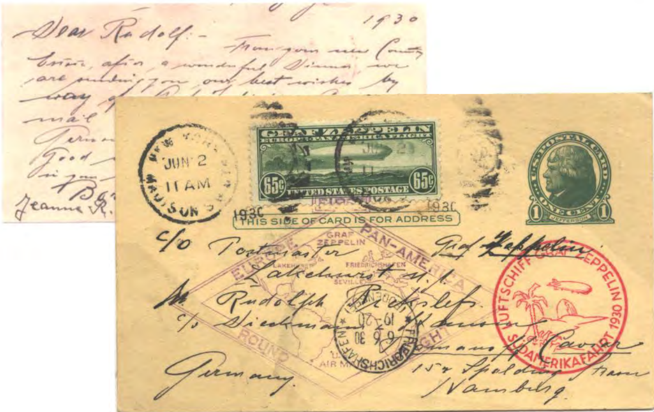
Personal Message on Card to Germany - A couple send best wishes by Graf Zeppelin "From your new Country Estate, after a wonderful dinner" to a friend in care of Romanoff Caviar in Hamburg.