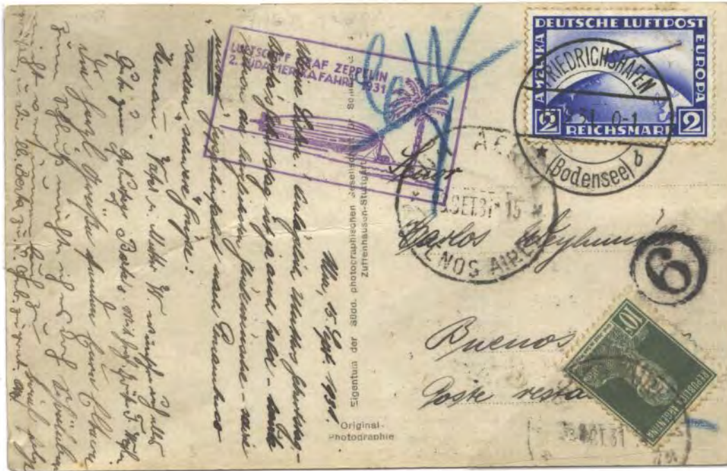
Birthday Greetings to Buenos Aires - Long personal message from two well-wishers - Postage RM 2.00 for transatlantic zeppelin card.

Postage Due on Arrival - Receiver was charged 10 centavos postage due for the poste restante (general delivery) fee - Blue letters "CW" are the initials of the addressee.