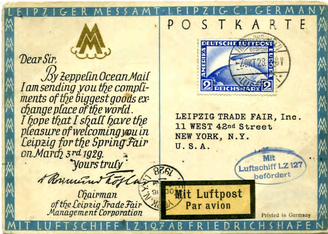
Leipzig Trade Fair Promotion - Postage RM 2.00 transatlantic zeppelin card.