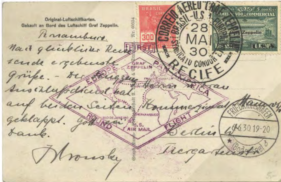
Brazil - Personal Message from Zeppelin Passenger - Post card purchased on the outbound flight and mailed after the landing at Recife - De facto postage to Europe for this flight was 5$000 zeppelin airmail, 300 surface.