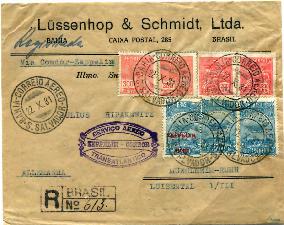
Brazil - Registered Mail from Machine Manufacturing Company - Postage 5$000 airmail (2 x 2$500 per 5 grams), 1$000 registration, 400 surface.

Registered mail was allowed for the first time on the third 1931 flight.