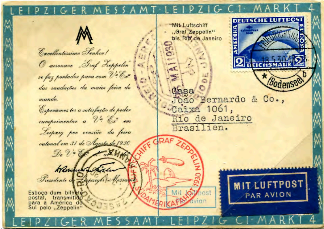
Commercial Advertising - Card promoting the Leipzig Trade Fair sent to a potential client in Brazil - Postage RM 2.00 transatlantic post card.