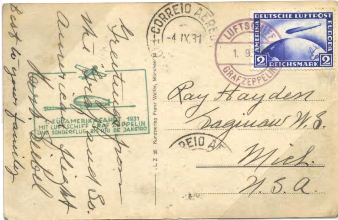
Passenger Mail - Post card written and posted on board by passenger Herbert Siebel. Postage RM 2.00 for transatlantic zeppelin card.

Three flights to Recife in autumn 1931 tested the proposed commercial route further. At Recife mail was exchanged with local airlines for transport within South America.