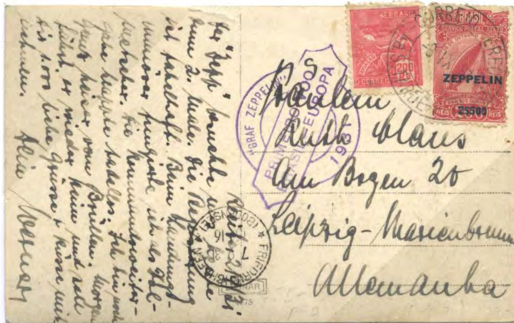
Mail from Member of the Ground Crew - "During the landing maneuver I functioned as interpreter. I am still hoarse from shouting." - Postage 2$500 zeppelin airmail, 200 surface card.