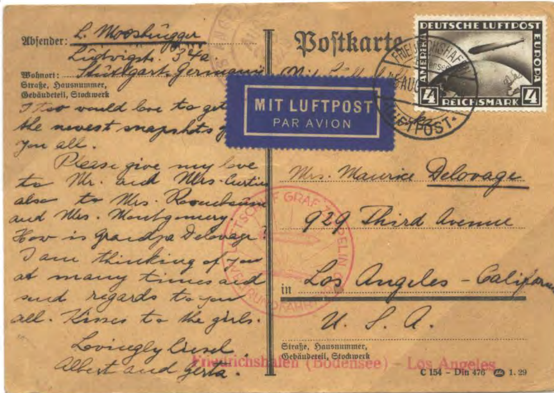
Flown across Siberia and the Pacific Ocean - Long personal message covers both sides of the card - Postage RM 4.00 for zeppelin card from Friedrichshafen to Los Angeles.

Non-stop flights across Siberia, the Pacific, and the Atlantic further demonstrated the zeppelin capacity to cover great distances in the proposed commercial service.