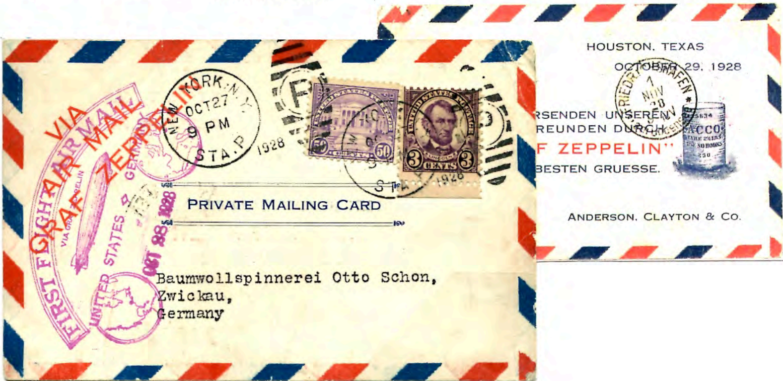
Commercial Advertising - Cotton broker in Texas sends greetings to a cotton mill in Germany - U.S. zeppelin post card rate 50¢ airmail, 3¢ surface.