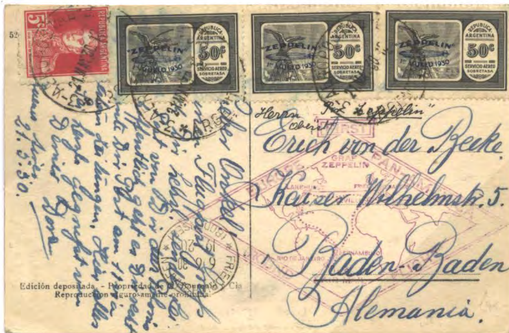
Argentina - From a German Expatriate - Personal message to her uncle in Baden-Baden - Flown on airplane connecting flight from Buenos Aires to Recife - Postage 1.50 pesos airmail, .05 surface.