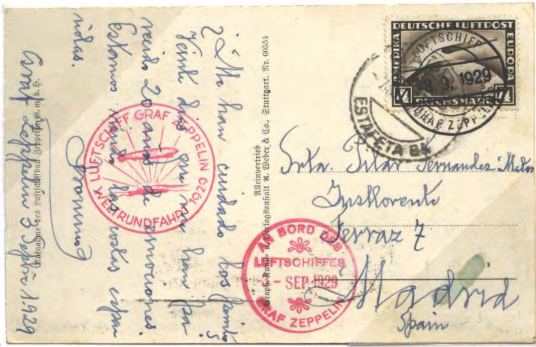
Passenger Mail from the Last Leg of the Flight - Posted on board the leg from Lakehurst to Friedrichshafen - RM 4.00 letter rate paid in error - Postage RM 2.00 transatlantic card.