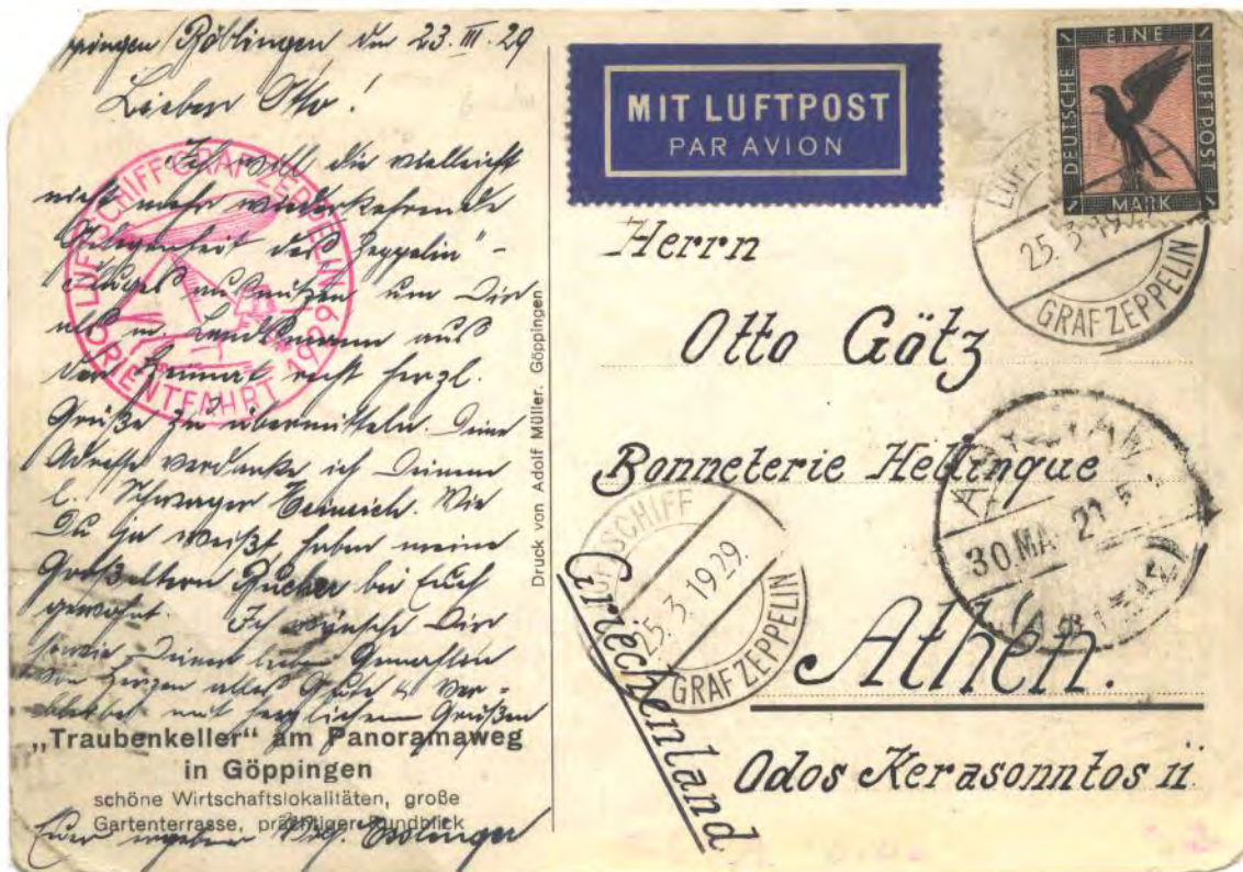
Card to Athens with On-Board Postmark - Non-philatelic personal message to a German acquaintance at a small business in the Greek capital - One of three known items with the on-board postmark sent to Athens - Note: Formerly listed as Athens drop mail, recent research indicates delivery by surface from Er Ramle to Athens instead.