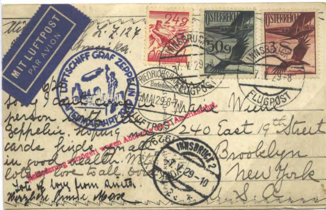
Austria - Personal Message between Family Members - Postal agreements allowed the zeppelin postage to be paid in Austrian currency - Postage 3.50 schilling zeppelin transatlantic card, .24 surface card.