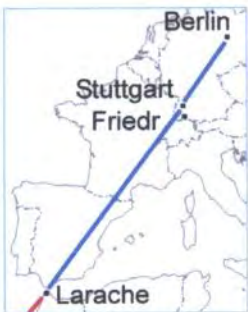
DLH flights to meet the zeppelin at Larache