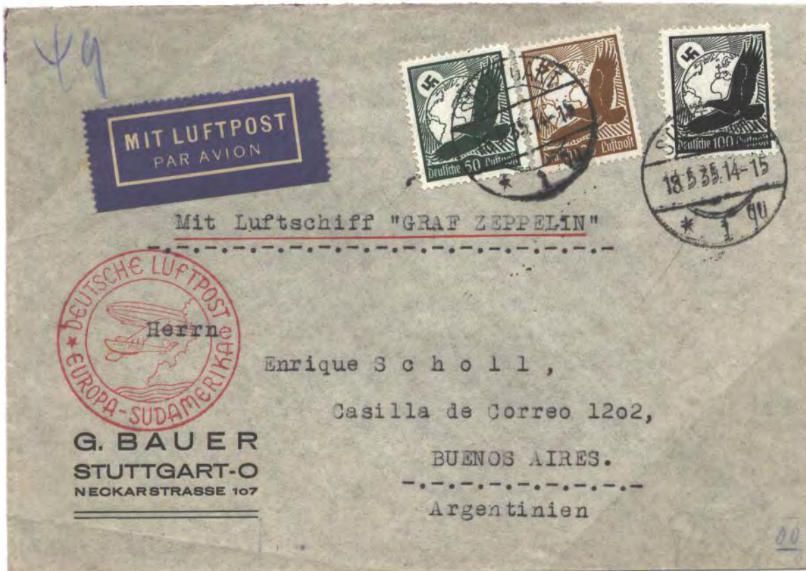
First Use of Cachet with New Code Letter "e" for Flight from Stuttgart - Introduced in late May 1935 to supplement the "☆" cachet for flights from Stuttgart - Late posting flown by DLH to Larache for pick-up by the zeppelin - Postage RM 1.50 airmail beyond Brazil, .25 surface.