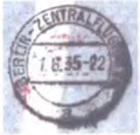
Berlin transit marking for connecting flight