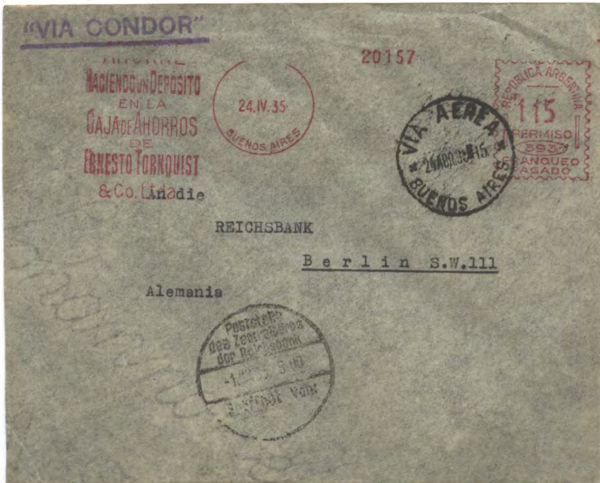
Scarce Argentine Meter Franking - Bank arrival marking confirms transport by zeppelin - Postage 1.00 peso airmail, .15 surface - Meter franking of Argentine zeppelin mail is seldom seen.