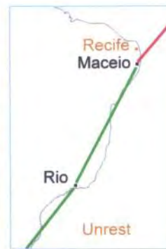
Dropped at Maceio during a Brazilian Revolution - Upon returning from Gambia, the Graf Zeppelin was forced to remain in the air for three days because of unrest at Recife - On the second day the mail was dropped at Maceio, further down the coast, and flown south by Condor from there.