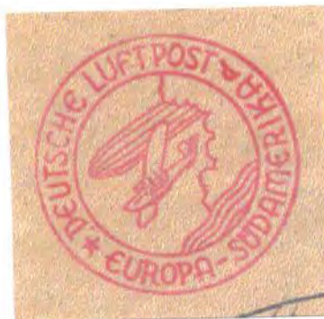
Lilac-red "d" Rubber