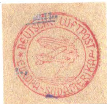
Scarlet "d" Metal

A different cachet from either the normal Stuttgart "☆" or the lilac-red rubber on board "d".