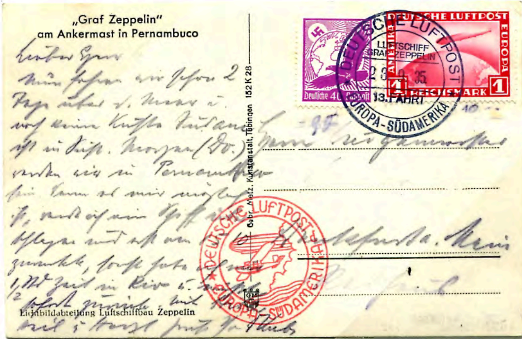
Passenger Card from a "Non-Postal" Flight - Thirteenth 1935 return flight.

Temporary Loss of Letter Mail Franchise - From July to mid-October all letter mail was flown by DLH - The zeppelin carried only on-board postings and heavier non-letter classes of mail.