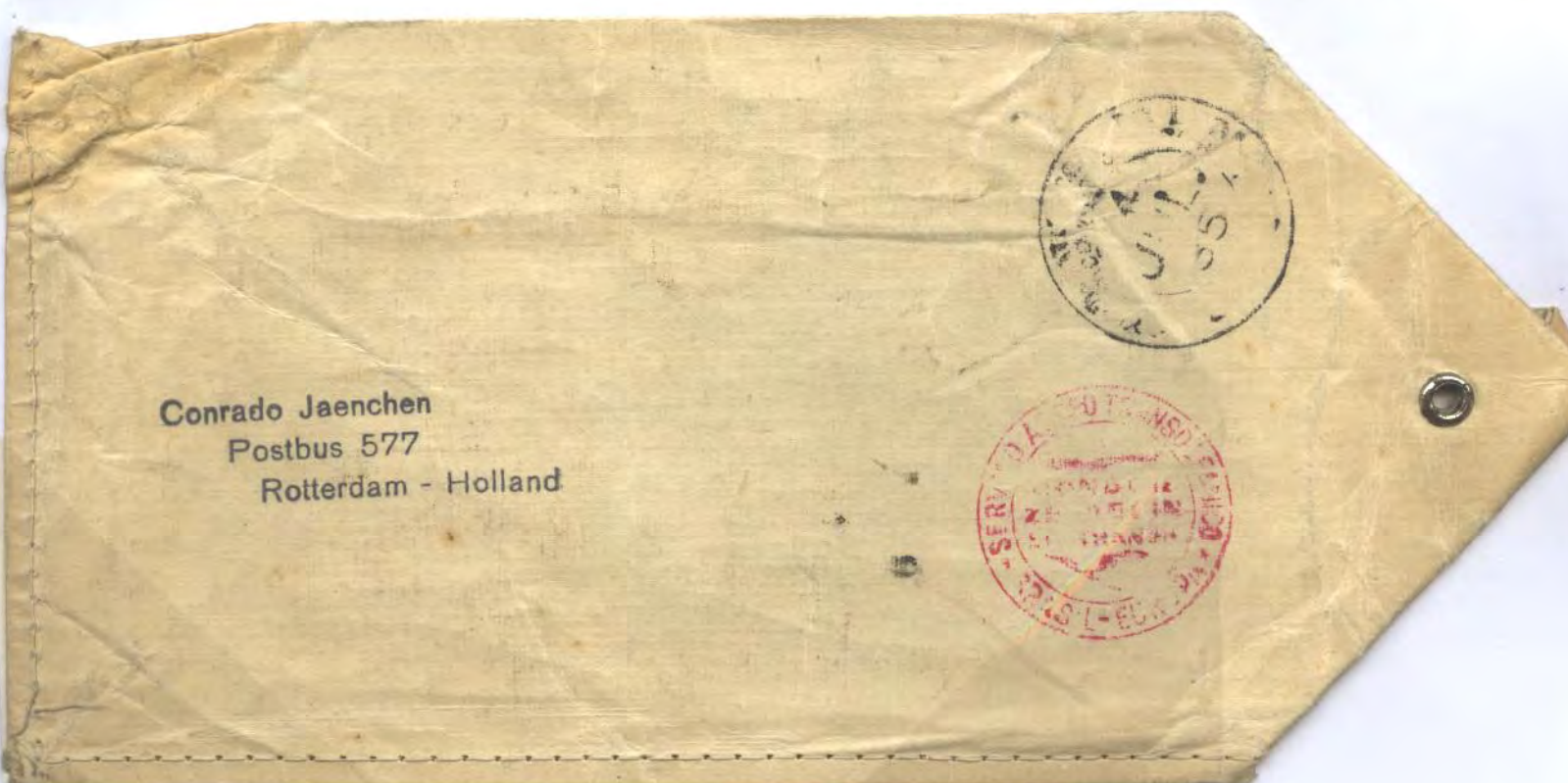
Coffee Sample Bag - Weight 175 to 200 grams - Postage on back 33$600 = 8 x 4$200 per 25 grams - reduced rate for sample merchandise.