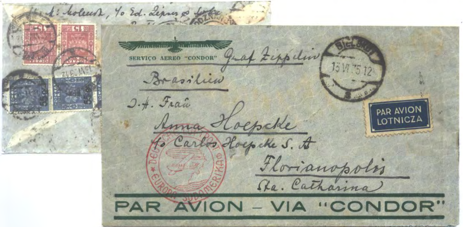
Poland - Cachet "e" for Flight from Stuttgart - Late posting flown by Deutsche Lufthansa from Stuttgart to Larache to meet the zeppelin enroute to Brazil.