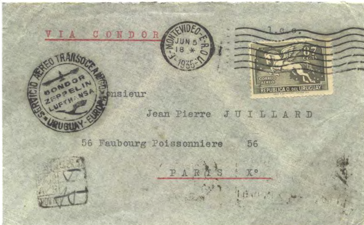
standard cachet in Spanish

Uruguay - Box with weight and airmail fee - Postage for 5 grams .75 peso airmail, .12 surface.