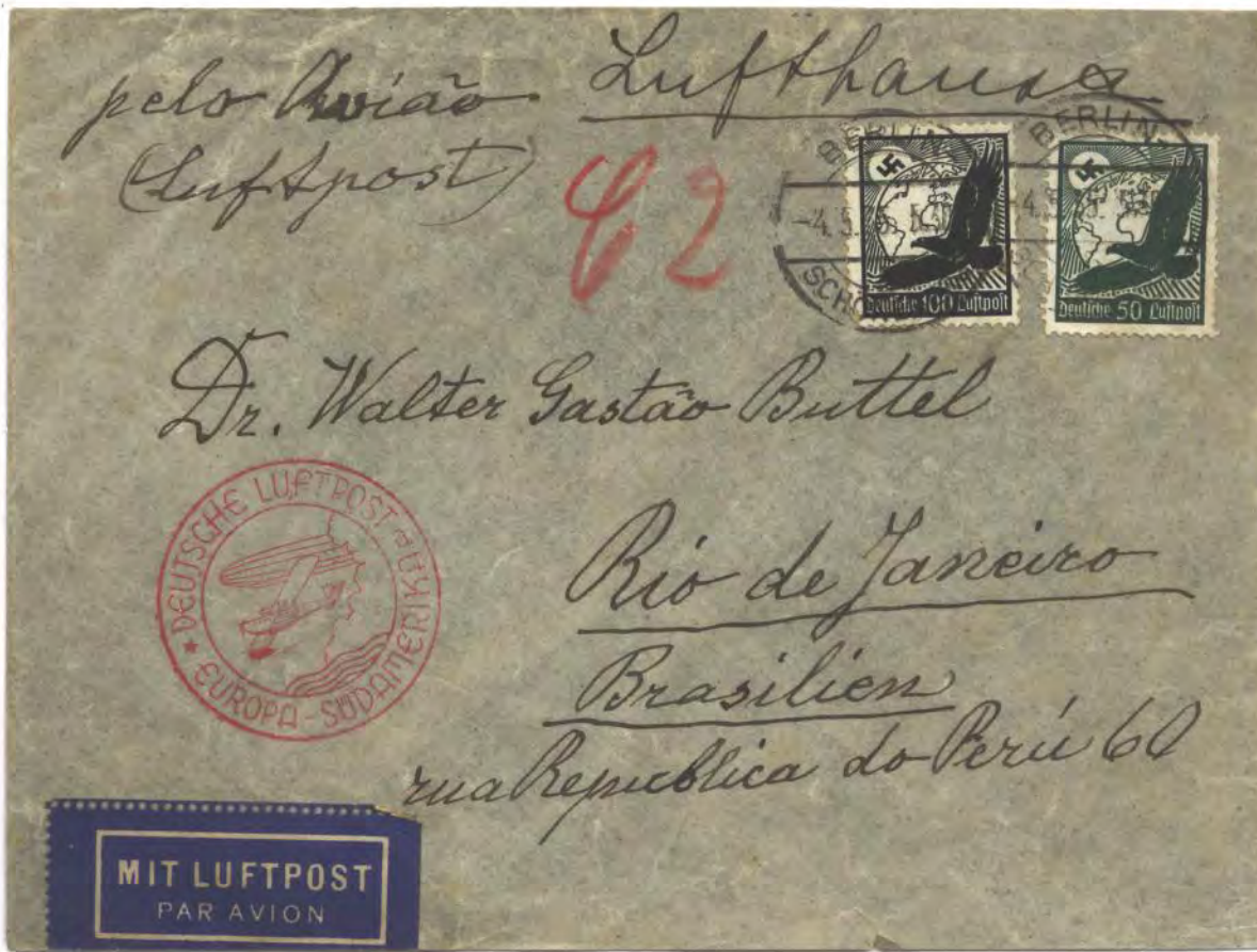
Red Crayon "C2" for Pneumatic Mail within Berlin - Cachet Code Letter "a" for Berlin - Destination office number "C2" and minutes in postmark times show delivery by pneumatic tube to the Berlin Central Post Office - Special flight from Berlin to Stuttgart to catch the flight to Larache, where mail was transferred to the zeppelin - Postage RM 1.25 airmail, .25 surface.