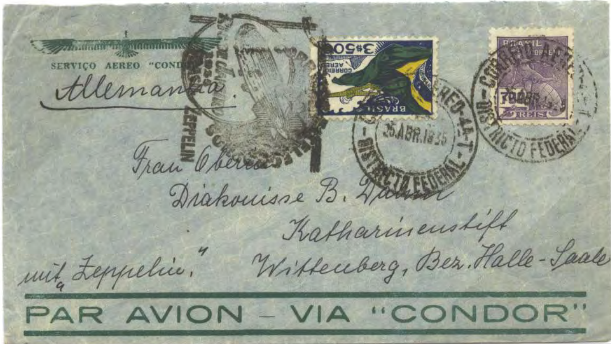
Special Cachet for Tourist Fair - Used in place of the standard cachet on part of the mail posted at Rio while the fair was being held - Postage 4$200 airmail.