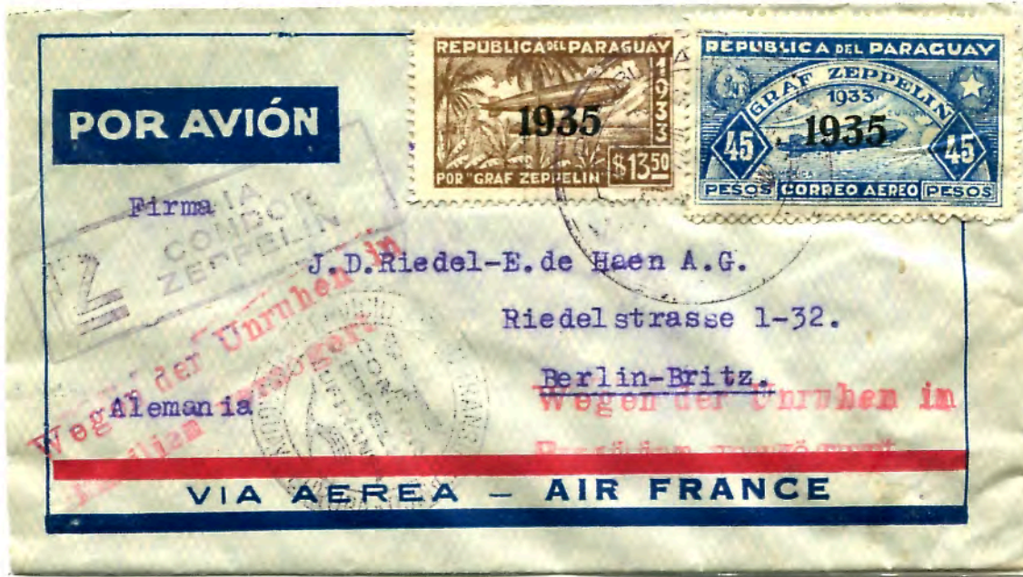
Small Cachet Struck Twice - (62 by 12 mm) - Postage 59.00 pesos airmail (7 x 8.40 per gram = 58.80 rounded up to nearest peso), 2.50 surface, 2.00 registration (.50 airmail, 4.50 ordinary postage, registration label on back).