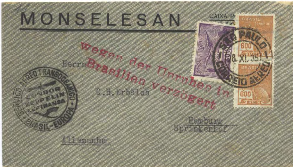
Long Cachet - 84 by 10 mm - Three sizes of cachet are known, apparently made from type obtained at a stationery supply shop.

Cachet Reads "Delayed by Unrest in Brazil" - Delayed on its route north from São Paulo to Rio de Janeiro, this letter missed the 29 November zeppelin departure, and was flown by the zeppelin to Europe one week later.