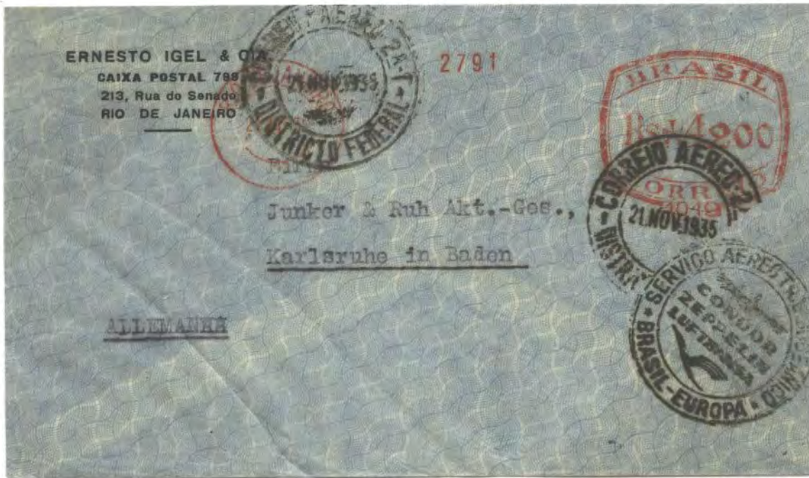
Brazil Meter Franking - Dropped at Gambia and flown to Europe by DLH - Postage 4$200 airmail.