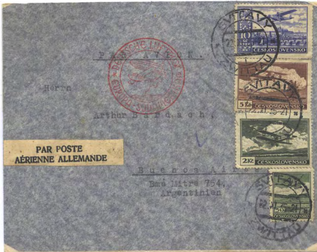
Czechoslovakia - By airplane via Prague, Berlin and Stuttgart to Gambia - Picked up by Graf Zeppelin and shuttled to Brazil - Postage 15.00 koruny airmail, 2.50 surface.