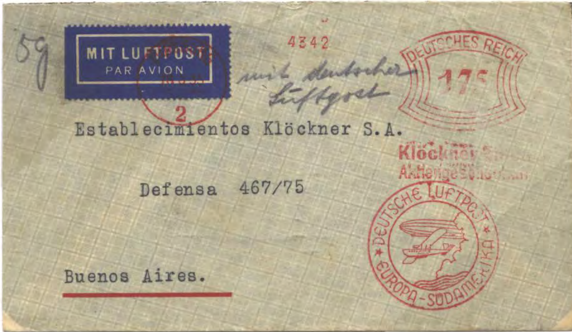
Cachet with Code Letter "☆" for Flight from Stuttgart - Late posting flown by Deutsche Lufthansa to Larache for pick-up by the zeppelin - Postage RM 1.50 airmail beyond Brazil, .25 surface.