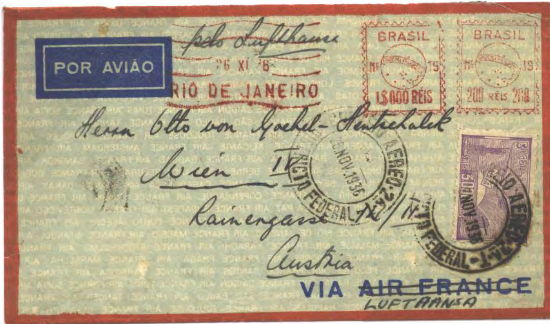
Meters Plus Stamp - Dropped in Gambia and flown by the DLH to Europe - Postage 4$200 airmail.