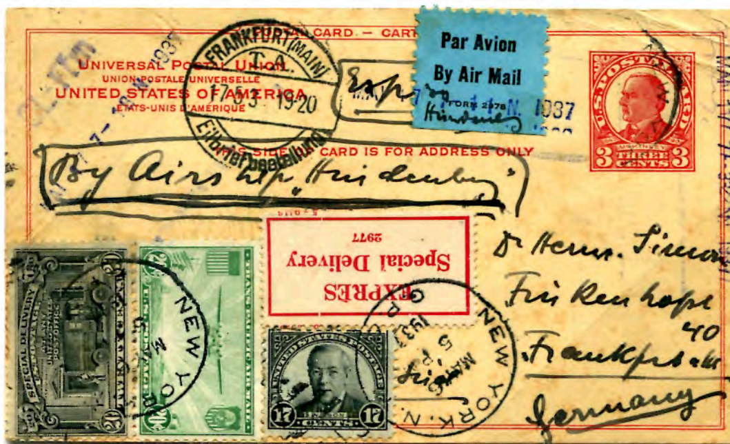
Express Mail Delivered by Pneumatic Mail within Frankfurt am Main - Three pneumatic mail timestamps show rapid delivery through the city - Postage paid 40¢ zeppelin, 20¢ express.