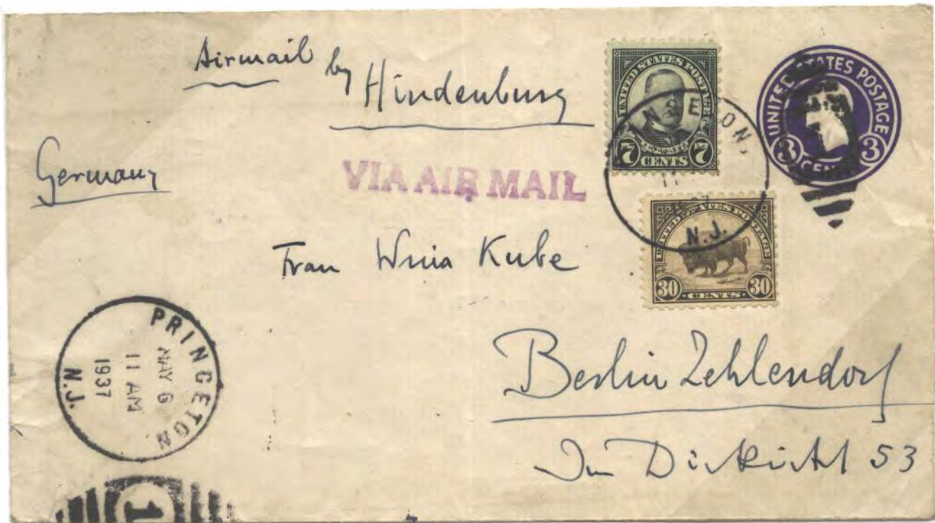
Dispatched on Steamer S.S. American Farmer - Routed by Hindenburg and postmarked on the morning of the crash - Postage paid 40¢ zeppelin.

No Return Flight because of Hindenburg Disaster - Most mail for the return flight was sent by ocean steamers to Europe - Senders could choose to have their mail withdrawn instead.